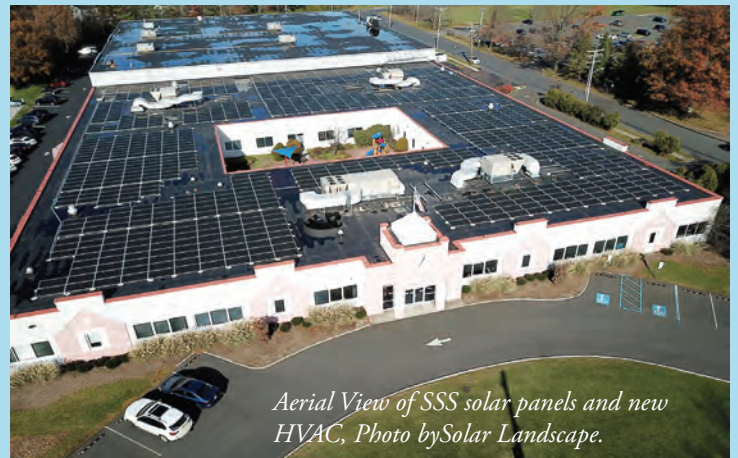
Aerial View of SSS solar panels and new HVAC, Photo by Solar Landscape.

In 2018 the Board of Trustees took big steps to improve the School's energy operations and it has paid off. In late 2018, new rooftop solar panels were installed as well as indoor energy efficient LED lighting. These high-tech systems combined with a new, more efficient HVAC system installed in 2019 saved Summit Speech School a very substantial 33% ($51,104) in electricity costs in fiscal year 2018-2019 compared with the prior year.