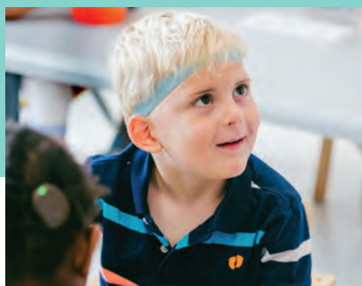
Cooper talking and snacking